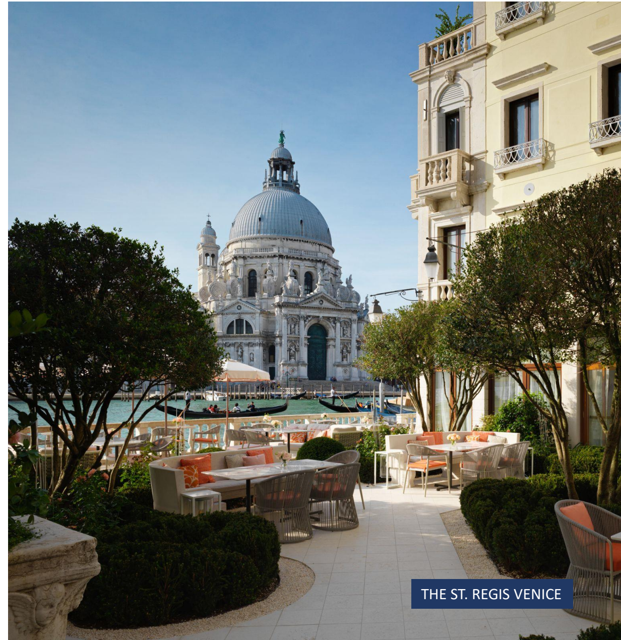
THE ST. REGIS VENICE