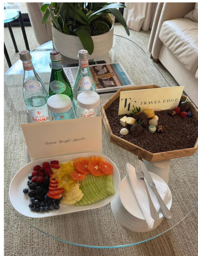
Personalized welcome amenity